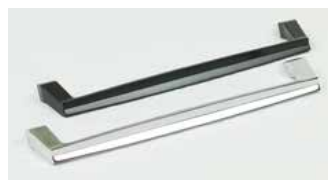
Standard Handle Finishes